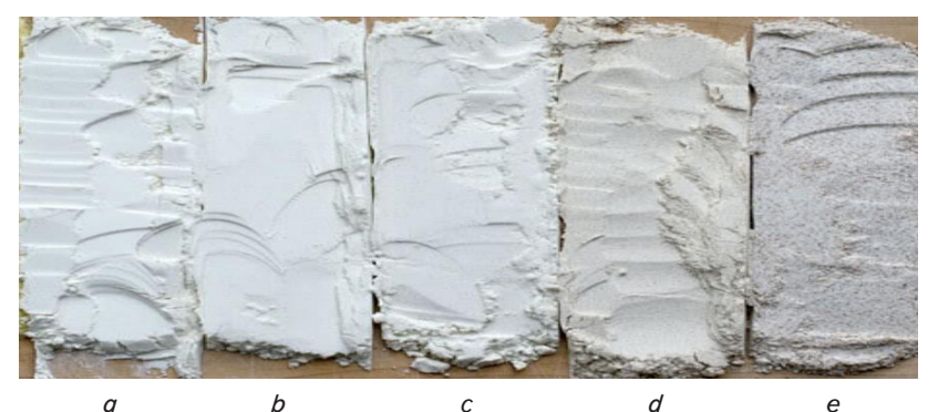
Fig. 1. Change in the organoleptic indicators of flour made from sprouted grains of chickpea depending on the time of steeping and the concentration of sodium hydroselenite in the solution for steeping: a – steeped for 12 hours, mass share of selenium is 24 µg/g; b – steeped for 12 hours, in an aqueous solution (control); c – steeped for 24 hours, mass share of selenium is 32 micrograms/g; d – steeped for 48 hours, mass share of selenium is 52 µg/g; e – steeped for 72 hours, mass share of selenium is

24 µg/g, in the solutions with a concentration of selenium of 20, 50, 75 µg, respectively. For the chickpea variety "Yugo-Vostok", one observes an increase of 6; 12 19 µg/g, in the solutions with a concentration of selenium of 20, 50, 75 µg, respectively. The tendency to an increase in the content of selenium in flour made from steeped grains is observed in all examined samples, which were steeped for 24, 48, 72 hours; however, when steeping during 72 hours with a concentration of selenium of 20 µg and above, there is a deterioration of the organoleptic characteristics of grains – there appear spoiled, blackened grains that affect the color of the resulting flour (Fig. 1, d).