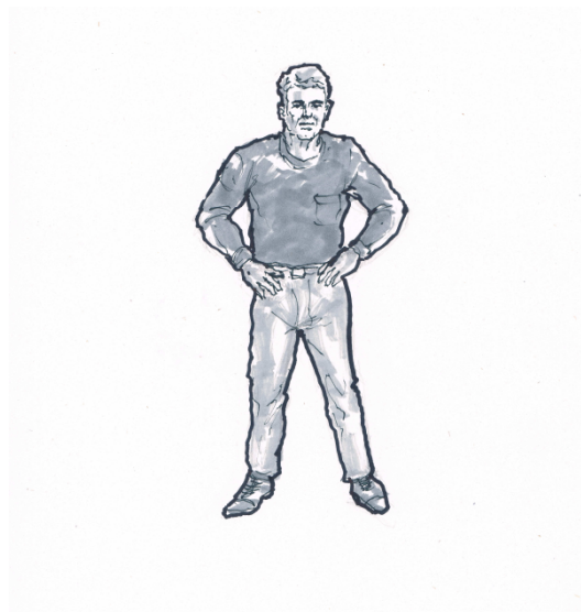
Figure depicts a posture of authority and control.