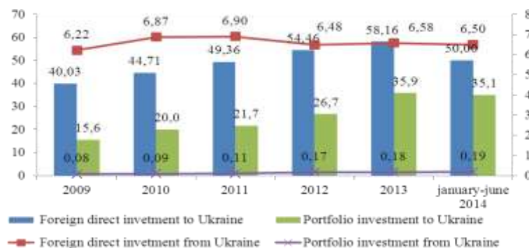
Fig. 3. The dynamics of the international investment activity of Ukraine during 2009–2014, bln. $US (completed by the authors) [18]

Researching foreign investments, the situation during the last five years look as follows (fig. 3).